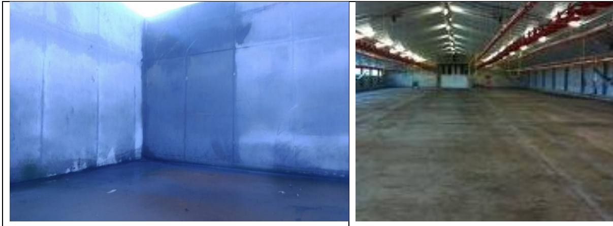
Fig 1: Treated food storage outside area left, and chicken farm to the right.

SA CAM 110 is a spray applied Colloidal Nano Silica that provides improvements to new as well as existing concrete surfaces, the application is a “One Time” process that last for the Life Cycle of the project. Additionally, the materials contain “Zero VOC’s” and can be used without any negative effects on employees or the environment.